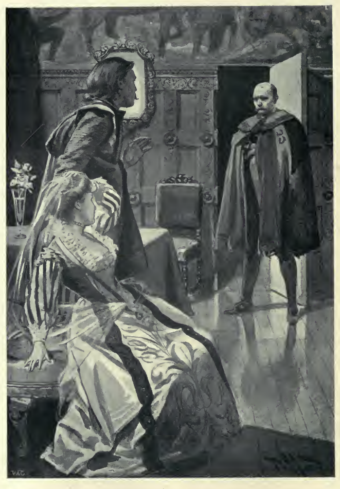
"Throwing open the secret door . . . he confronted them." Farewell, Nikola."] [Page 177